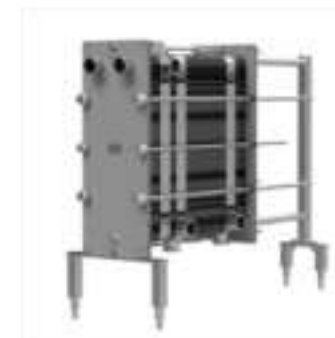
Plate Heat Exchanger

Think-tops are used for sending feedback to PLC. Condition Monitoring is used to measure vibration and the inside temperature of the pump